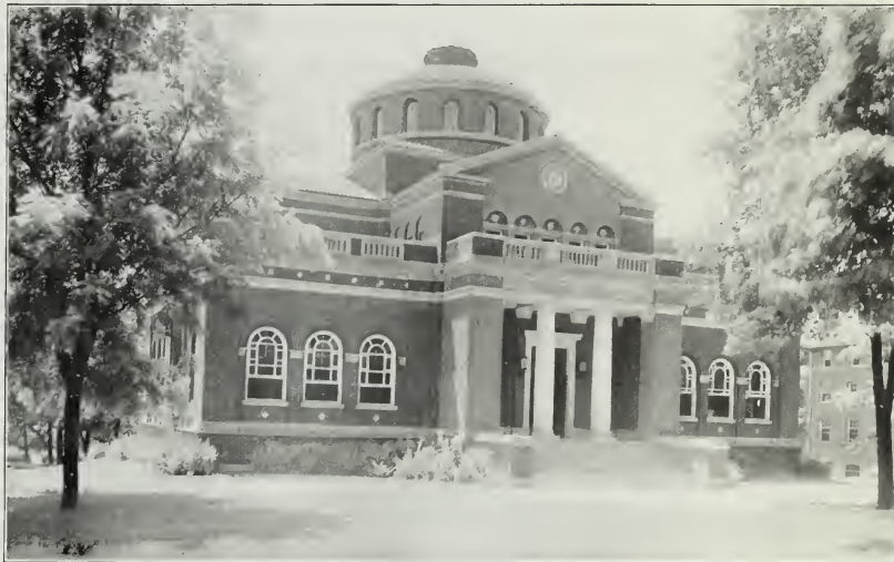
THE ALUMNI LIBRARY